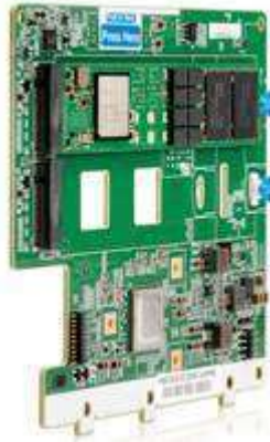
NS204i-d (Synergy 480 Gen10 Plus Compute)