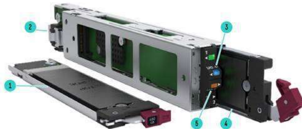
HPE NS204i-u Gen11 Boot Device